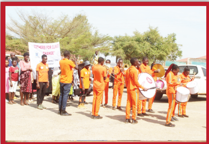
Mobilizing Fathers, Men and young men for climate change action in Uganda by Western Uganda FBO Network

2024, Project : Advancing Climate Change Communication through inter-faith & inter-cultural Sports and Poetry, Funded by: Korea Safety Health and Environment (KOSHE).