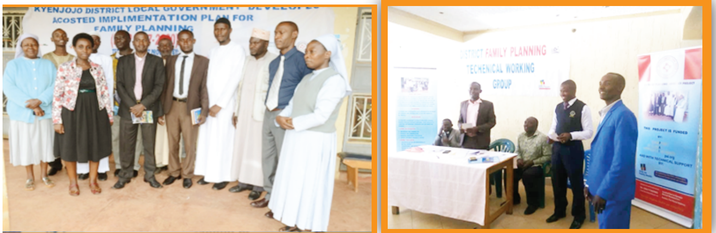
Figure 1 Kyenjojo FP working group visit to Kagadi during launching of Kagadi Multi-sector Family Planning working group

Kagadi District DCIP was developed Kyenjojo & Kagadi district Family planning multi-sector / working group was established.