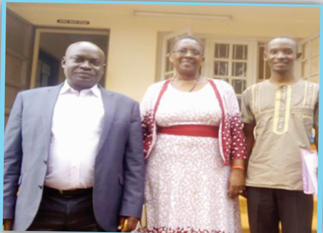
Figure 2 DHO , ADHO, ED WUFBN AND DHE KAGADI DISTRICT AFTER LAUNCHING OF DCIP FOR KAGADI DISTRICT