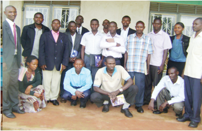
2022/2023, Project: Emanzi Etegekera Eka Nobuhangwa Ha Kyoto “Hero Family Planning: Environment Camp Fire Project”, Funded by: 128 COLLECTIVE