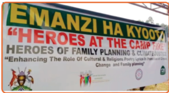
“Hero Family Planning & Environment Camp Fire Project”

4. Conducted EKYOTO Sessions / outreaches for Emanzi (Hero men’s) family planning campfire in the selected hotspot areas.